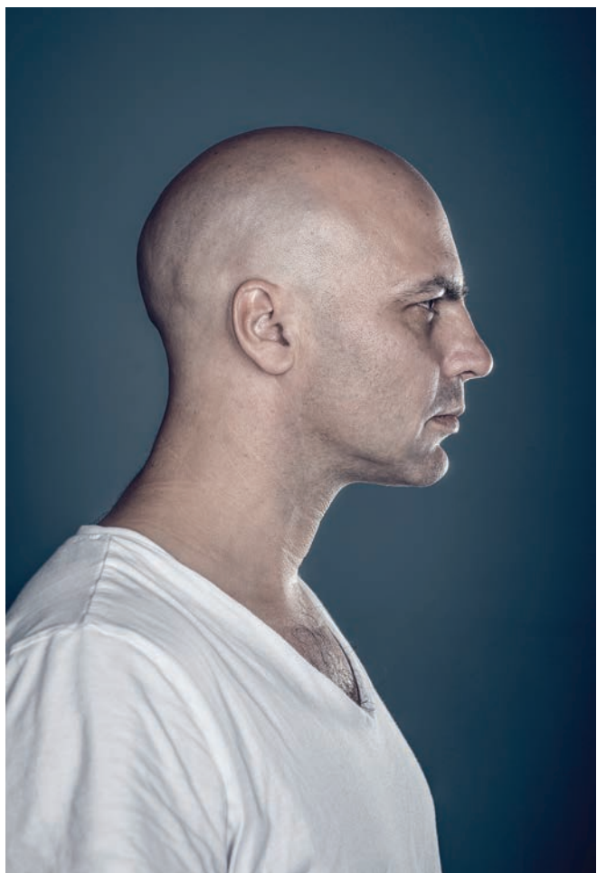
The Hitman 2015