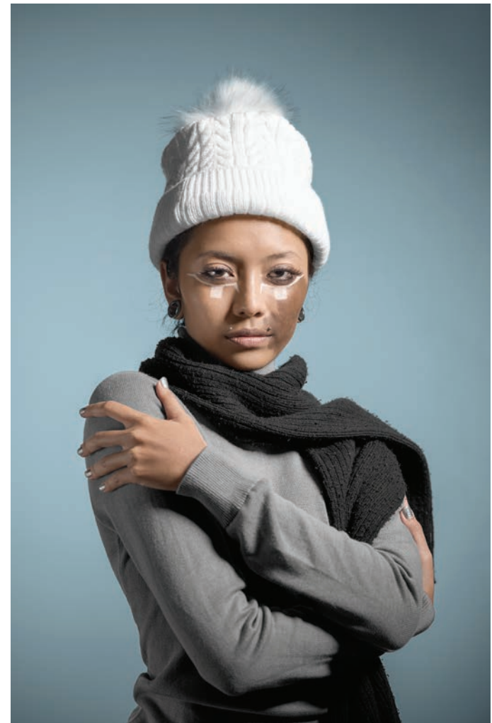
Comfy Skin 2015