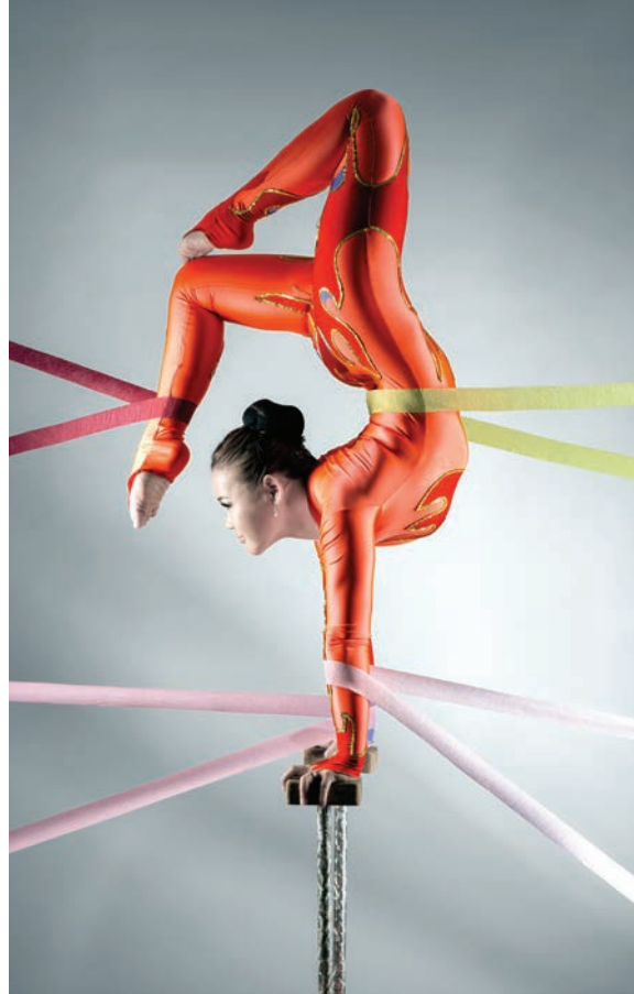
Legs Up 3 2015