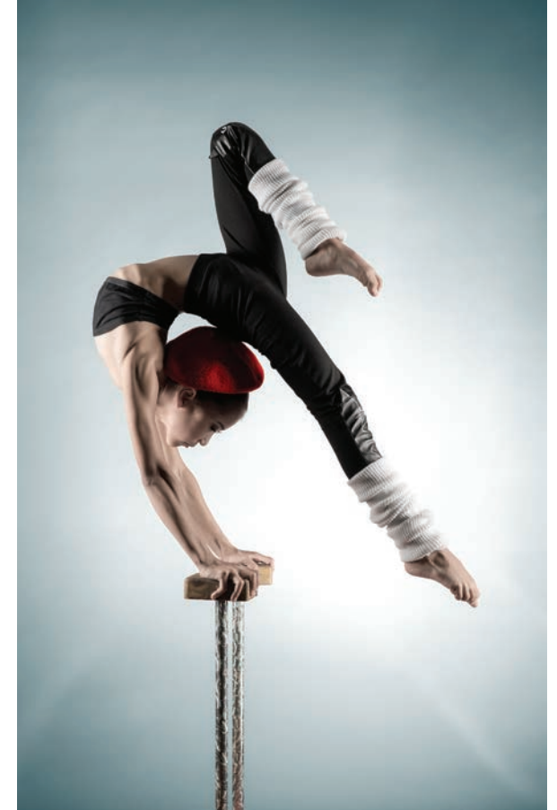
Legs Up 4 2015