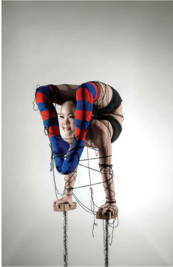
Legs Up 5 2015